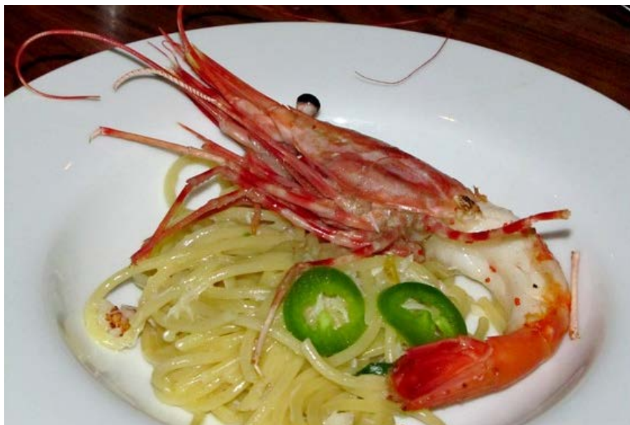
Spot prawn with Dungeness crab and jalapeno spaghetti at Strand House